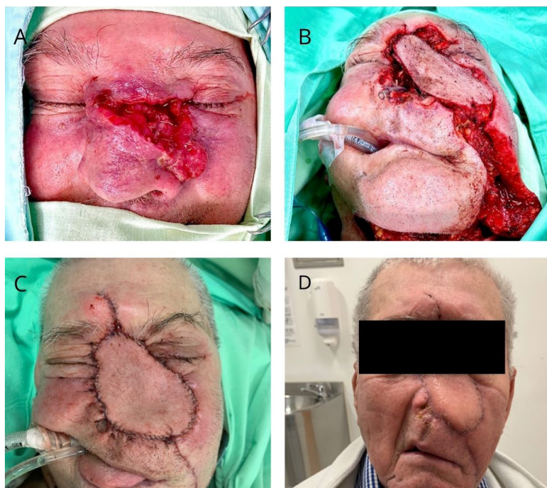
Figure 2. Standard SATF surgical technique. A) Intraoperative evaluation of the skin lesion on the back and nasal bridge. B) Reconstruction of defects with the standard SATF technique. C) Assessment in the immediate postoperative period. D) Evaluation in the late postoperative period.

The use of pedunculated myocutaneous flaps, such as the pectoralis major flap, is another excellent surgical option, characterized by its technical simplicity and good blood supply 18,19 , but the disadvantages of these flaps must be considered, such as the large volume, the secondary surgical revision and significant rates of complications, especially in female patients 20,21 .